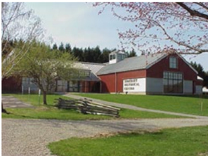
Somerset Historical Center, Visitor Center

participantes aprenderán acerca de los esfuerzos de la Asociación para el Patrimonio del Área de Johnstown para preservar e interpretar la historia local a través de asociaciones y museos sustentables, y visitarán el Museo de la Inundación de Johnstown; Wagner Ritter House y el Centro de Descubrimientos de Johnstown.