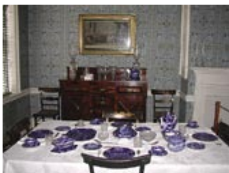
Rapp House, Dining Room