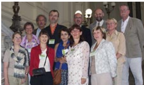
The new ICR Board