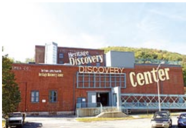
Heritage Discovery Center, Johnstown

¿Cuál es el futuro de los Museos Regionales? Qué estrategias deben adoptar para prosperar en una economía global? Se anima a los ponentes a discutir asuntos relativos a la sustentabilidad económica, los métodos para acrecentar la participación de la comunidad y los retos para documentar y coleccionar, así como para interpretar el cambio cultural y el paisaje.