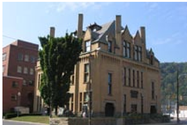
Flood Museum, Johnstown

Participants will visit Old Economy Village, challenged with interpreting the Harmony Society's industrial and manufacturing community and the Children's Museum of Pittsburgh, a "green" museum known for its community involvement. Attendees will also have the opportunity to visit the Carnegie Museums; the Nationality Rooms at the University of Pittsburgh; Clayton, the home of industrialist Henry Clay Frick and Frank Lloyd Wright's Fallingwater.