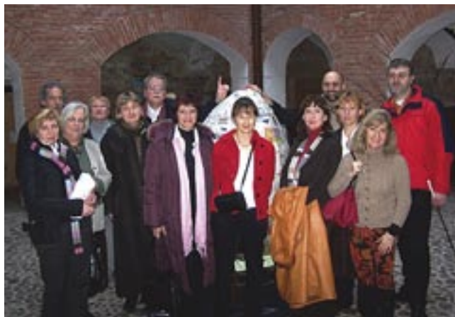
Board meeting meeting in Jurmala: Visit of the castle and museum in Ventspils

The board also prepared the next ICR Annual Conference in Pittsburgh. We are looking forward to seeing you in Pittsburgh.