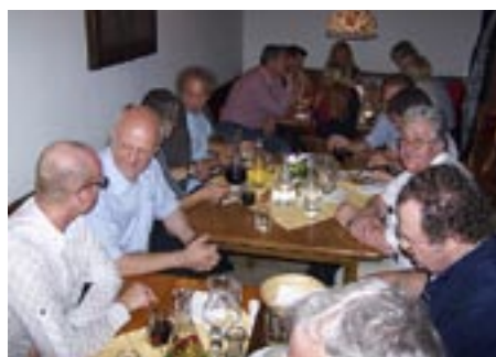
Discussions at the Vienna Heurigen tavern...