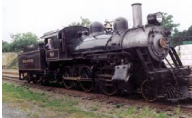
Post conference Tour: Strasburg Rail Road Lancaster

Se dará transportación de Johnstown al aeropuerto de Pittsburgh el 25 de octubre. Sin embargo, se avisa a los participantes que reserven vuelos que salgan del aeropuerto de Pittsburgh después de la 1 p.m. o que planeen un día extra en Pittsburgh. No hay transportación regular desde Johnstown al aeropuerto de Pittsburgh. United Airlines vuela de Johns-