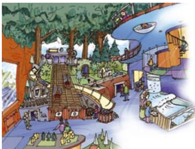
Johnstown Children's Museum

La Conferencia concluye en Johnstown, que se mantiene como una comunidad a pesar de tres desastrosas inundaciones, reveses económicos y pérdida de la industria. Los