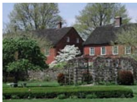
Old Economy Village

Están Uds. invitados a unirse a colegas internacionales en la Conferencia Anual de ICR, del 19 al 24 de octubre de 2008 en Pittsburgh y Johnstown, Pensilvania, Estados Unidos. El tema es "Los Museos Regionales en la Era Postindustrial". Nuestros coanfitriones son el Consejo de Museos de Pensilvania Occidental, la Federación de Museos y Organizacio-