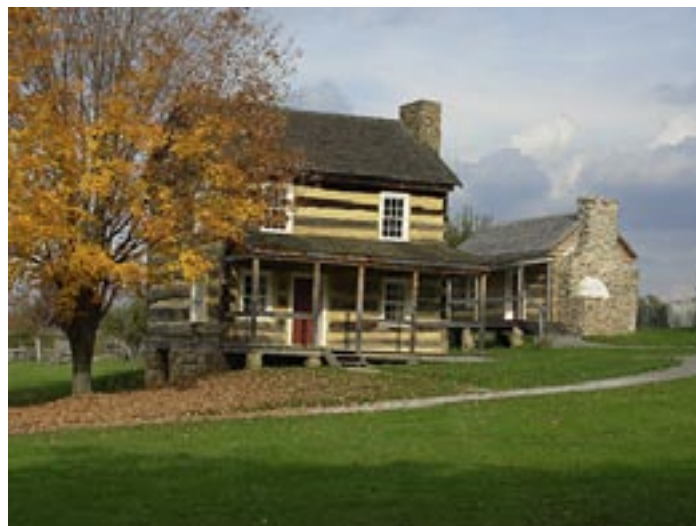
Somerset Historical Center