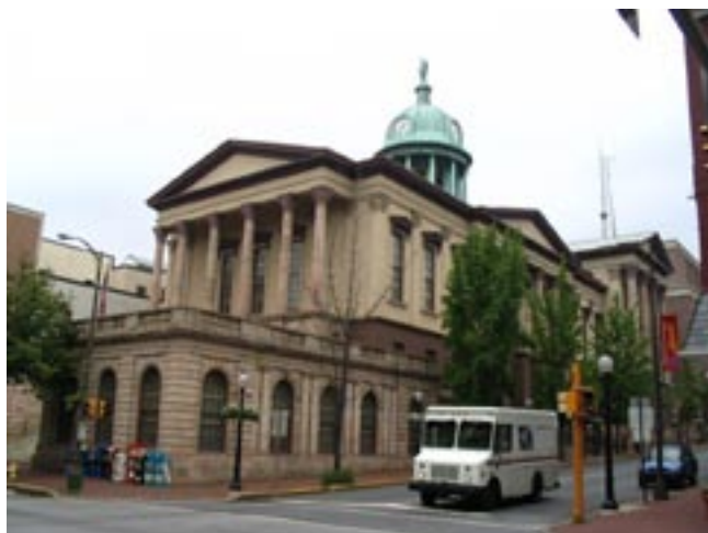
Post conference Tour: Lancaster

Por favor, contacte a Sue Hanna en shanna@state.pa.us