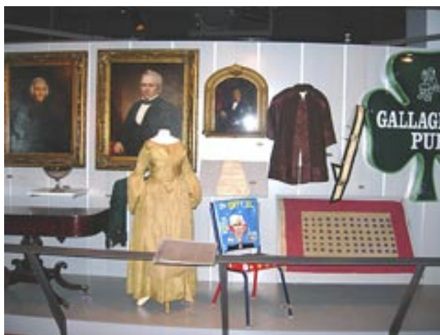
Senator John Heinz Pittsburgh History Center