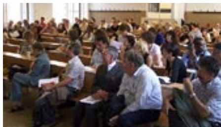
Joint session: ICR and ICME