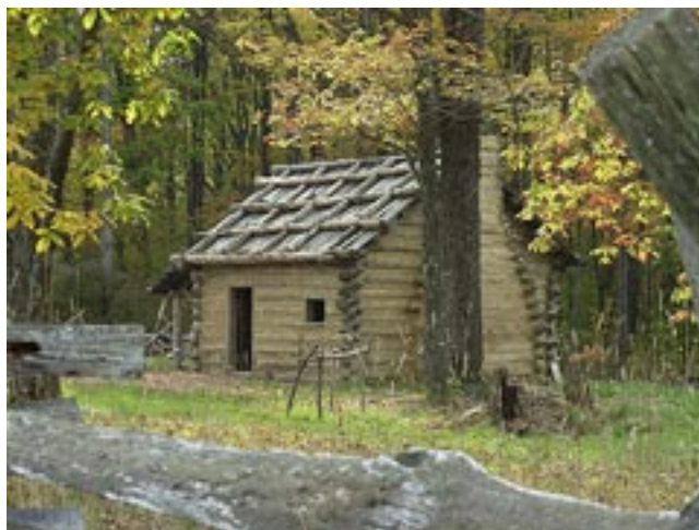
Somerset Historical Center