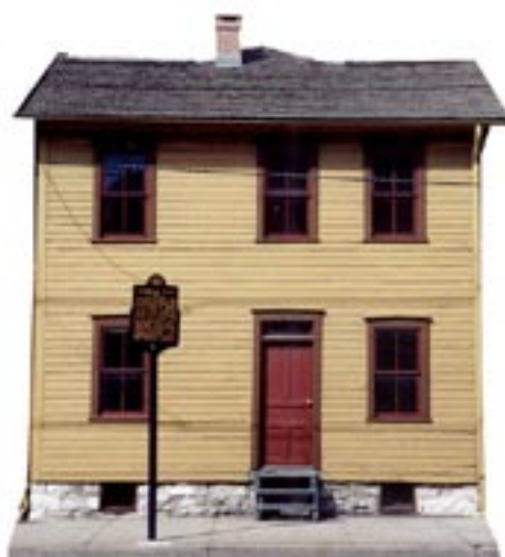
Wagner-Ritter House Johnstown